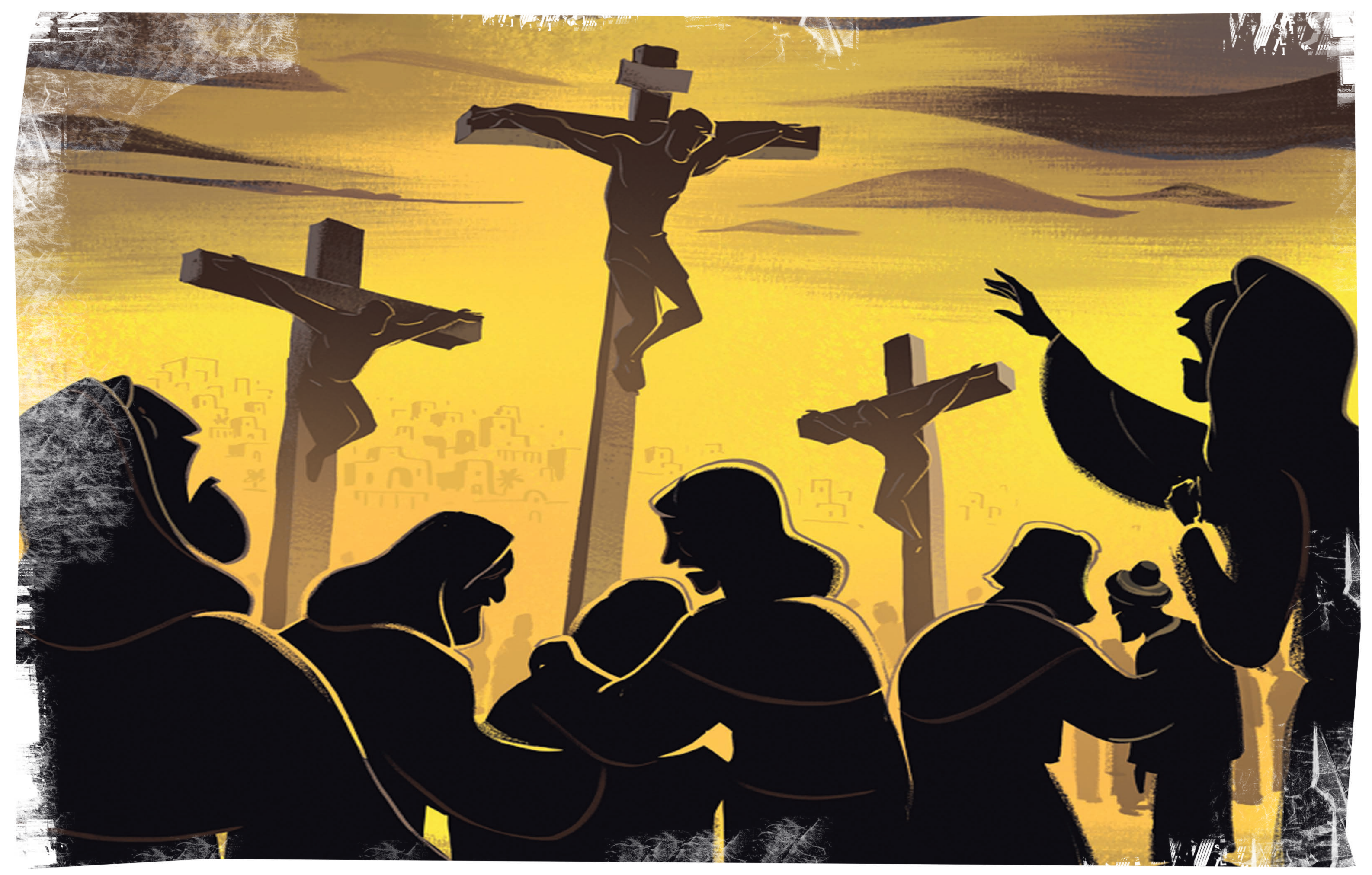
Jesus' Crucifixion and Resurrection (Matthew 26–28) • Easter, Session 2 • © 2018 LifeWay OK to Print